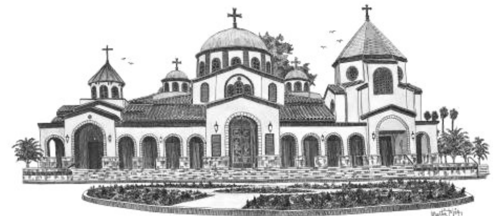
SAINT ANDREW ORTHODOX CHRISTIAN CHURCH RIVERSIDE, CALIFORNIA