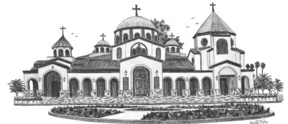
SAINT ANDREW ORTHODOX CHRISTIAN CHURCH RIVERSIDE, CALIFORNIA